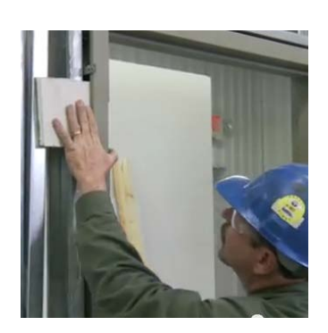
Attach to stud allowing for drywall thickness