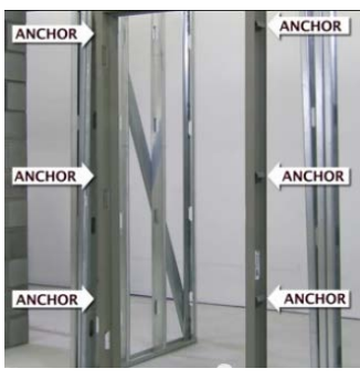
Proper anchor spacing