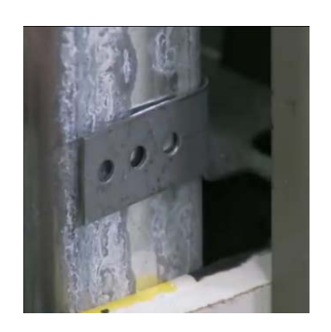
Ear of wood stud anchor