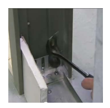
Drive pin anchor