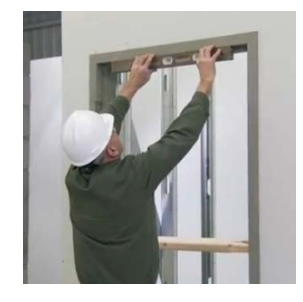
Final check for trueness